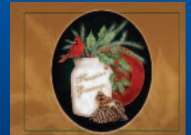
Dianne Risto 2009