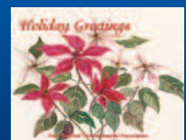
Diana Wakely 1997