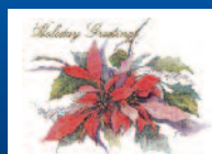
Sheila Fletcher 2000