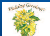
Diana Wakely 2001