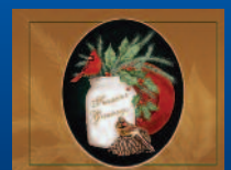
Dianne Risto 2009