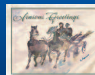
Betty Flower 2008