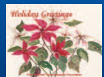
Diana Wakely 1997