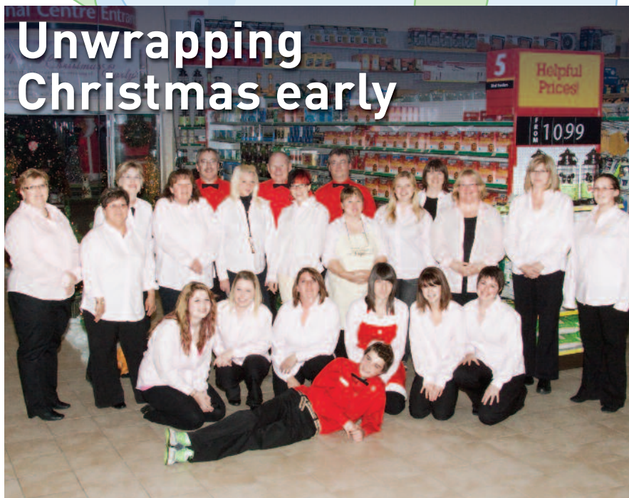
Renfrew Home Hardware officially unveiled Christmas on October 19, 2010. Proceeds of ticket sales from the event, totaling more than $2,000.00, were directed to the Mammography Unit at RVH.