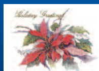
Sheila Fletcher 2000