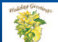
Diana Wakely 2001