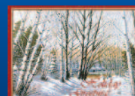
Armond Emond 2002