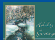
Dorothy Cook 2003