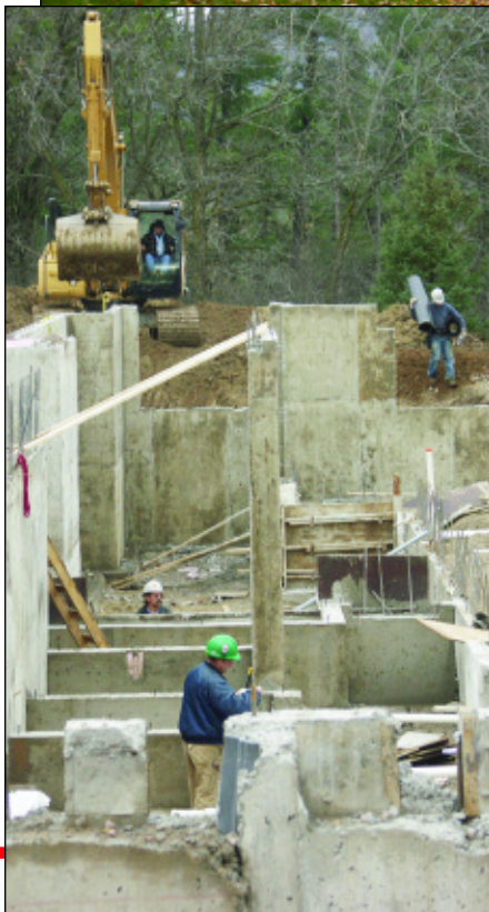
Counter-clockwise from top left, the stages of development from the beginning, October 11, 2006; to formation, November 15, 2006; to enclosure, January 11, 2007; to completion and celebration, June 21, 2007.