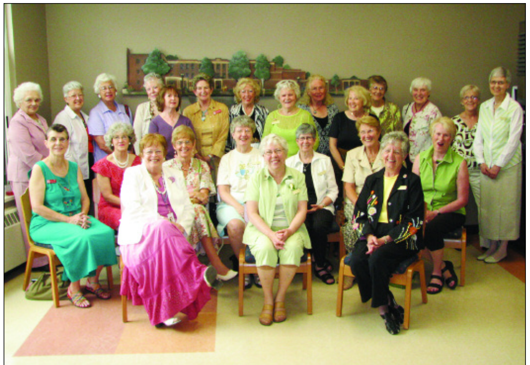
Representatives of the RVH Auxiliary pose proudly in front of the new sculpture, placed in their honour in the hospital cafeteria.

"Their contributions to Renfrew and to Renfrew Victoria Hospital are priceless."