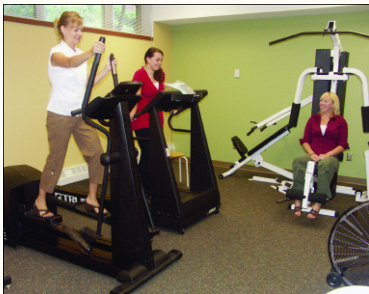
Ottawa Valley Physiotherapy staff try out the equipment in their work-out room.

Currently, Ottawa Valley Physiotherapy and the Alcohol, Drug and Gambling Assessment Referral Service are leasing space at 510 Raglan Street North.